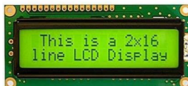
Figure 5: 16x2 Alphanumeric Display.

An LCD (Liquid Crystal Display) screen is an electronic display module and has a wide range of applications. A 16x2 LCD is a very basic module and is very commonly used in various devices and circuits. A 16x2 LCD means it can display 16 characters per line and there are 2 such lines. In this LCD each character is displayed in a 5x7 pixel matrix. The 16 x 2 intelligent alphanumeric dot matrix display is capable of displaying 224 different characters and symbols. This LCD has two registers namely, Command and Data. This is shown in the Figure 5.