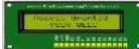
Figure 8: Smart Locking system – Step2.