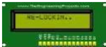
Figure 9: Smart Locking system – Step3.