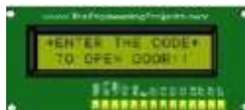
Figure 7: Smart Locking system – Step.