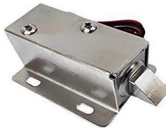
Figure 4: 4x4 Solenoid Lock.

Solenoid lock, also known as Actuator Lock, is used for the actual locking. Solenoids are basically electromagnets: they are made of a big coil of copper wire with an armature (a slug of metal) in the middle. When the coil is energized, the slug is pulled into the center of the coil. This makes the solenoid able to pull from one end. This solenoid in particular is nice and strong, and has a slug with a slanted cut and a good mounting bracket. It's basically an electronic lock, designed for a basic cabinet or safe or door. Normally the lock is active so you can't open the door because the solenoid slug is in the way. It does not use any power in this state. When 9-12VDC is applied, the slug pulls in so it doesn't stick out anymore and the door can be opened. This is shown in Figure 4.