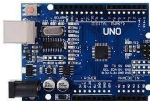
Figure 2: Arduino – UNO.

The diagram of Arduino is shown in Figure 2.