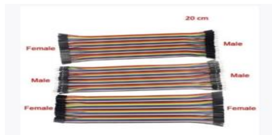
Figure 6: Jumper wire types.

Jumper wires types: The end points of male jumper wires have a pin that is used to connect to other components, whereas female jumper wires do not. Female jumper wires do not have pins on their ends and are used to plug into items. The most common type of jumper wire used to connect components is male-to-male jumper wires. This is shown in the Figure 6.