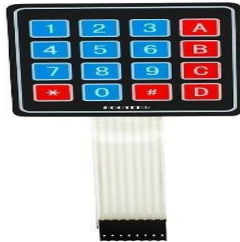
Figure 3: 4x4 Matrix Keypad.